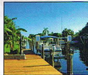
South Cape Coral Canal