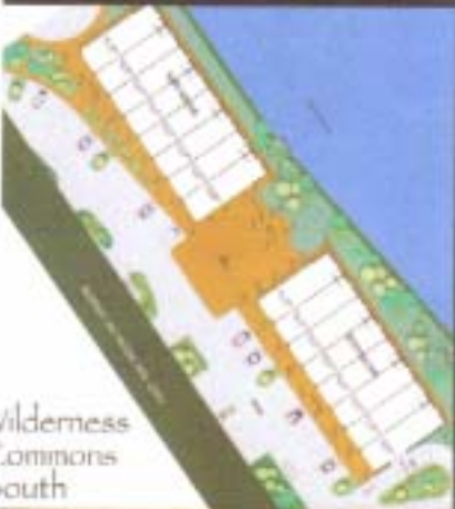
Wilderness Commons South