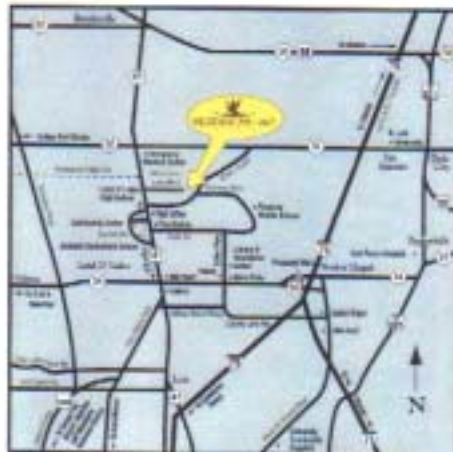
Wilderness Commons is 4 1/2 miles north of SR 54 on US 41

Proposed and existing residential and commercial growth is abundant along the 10-mile stretch of US 41 between SR 54 and SR 52. Large residential communities, all within a 5-mile radius of Wilderness Commons, include The Groves, Tierra Del Sol, Connerton, Asbel Creek and Lakeshore Ranch. FDOT traffic counts were in excess of 26,000 vehicle daily as of May 2006.